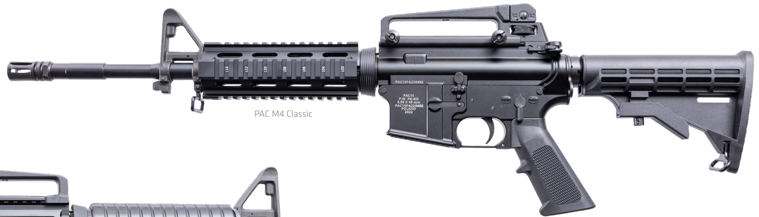
PAC M4 Classic

In addition, the rifle has a classic polymer stock and an A2 pistol grip. We have enhanced our rifles with a rear plate with a place to attach a sling swivel.