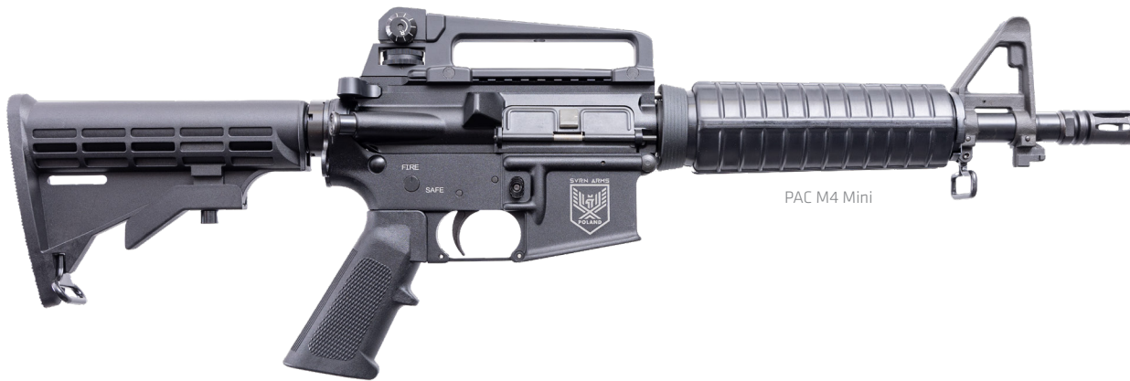
PAC M4 Mini